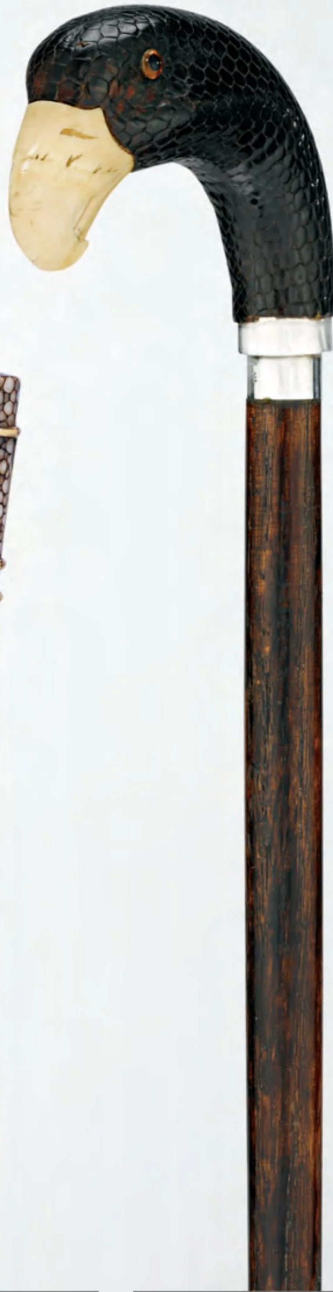
Parrot Snakeskin Cane Snakeskin lends the head of this parrot the ingenious appearance of feathers. 38" length. $1,650. #31-2231