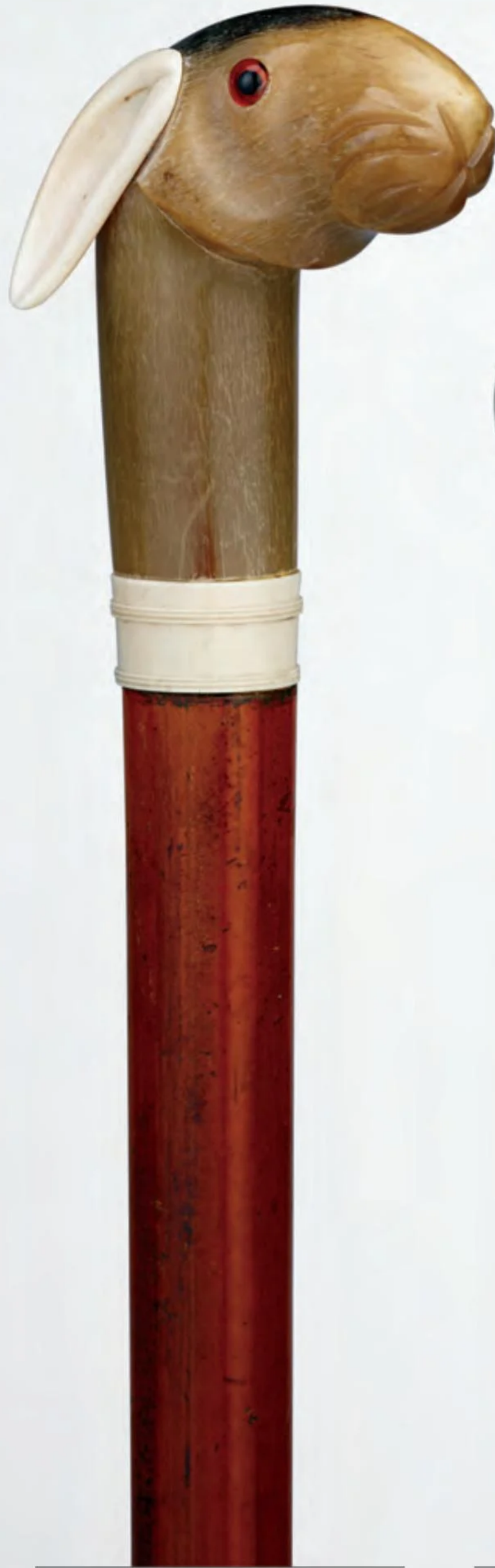
Rabbit Horn Cane A rabbit carved from horn tops this decorative cane. Its elongated ears lend a hint of whimsy to the charming design. 36" length. $1,885. #31-2102