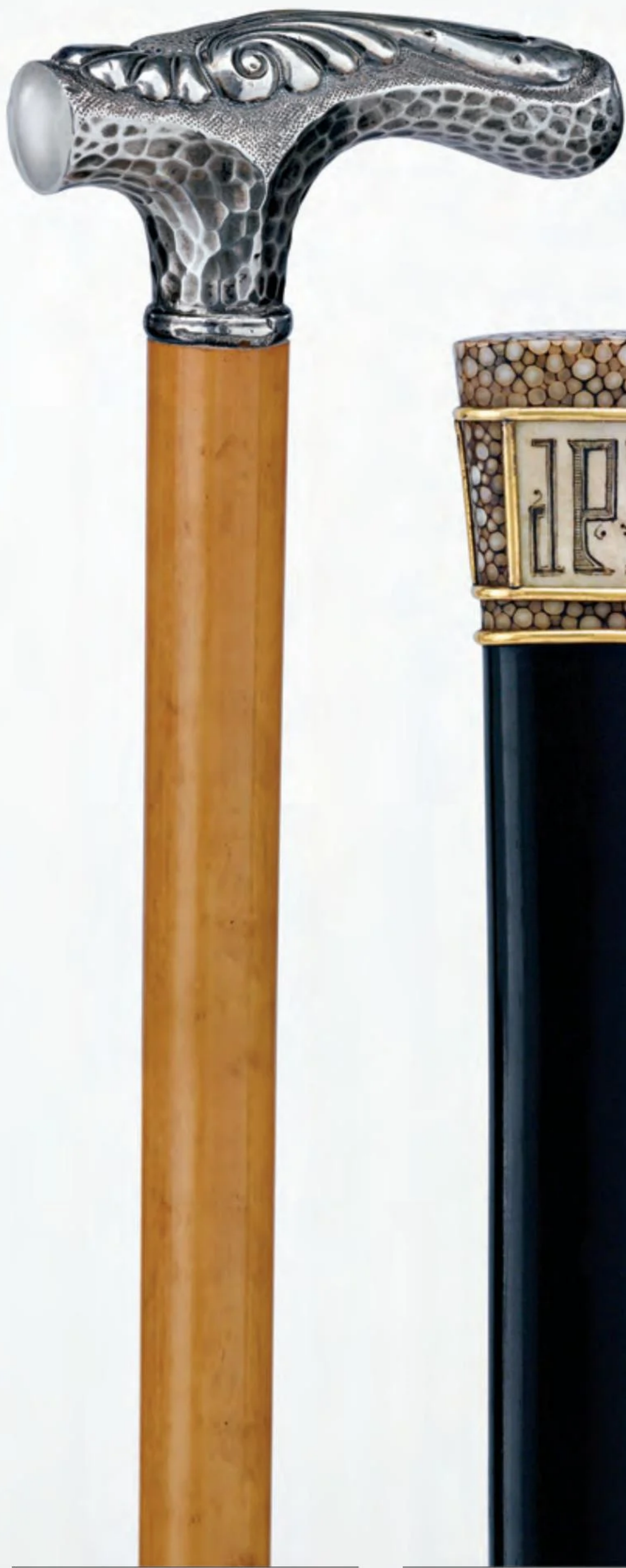
Silver Waves Cane A handle inspired by the sea is chased with stylized waves and shells atop a polished hardwood shaft. 33" length. $1,485. #31-1902