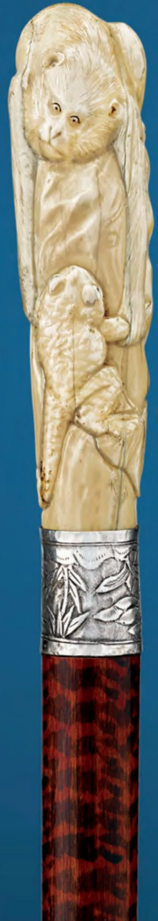
Monkey and Frog Cane An intricately carved scene of a monkey playing with a bullfrog tops this exquisite Japanese cane. 37" length. $1,785. #31-2203