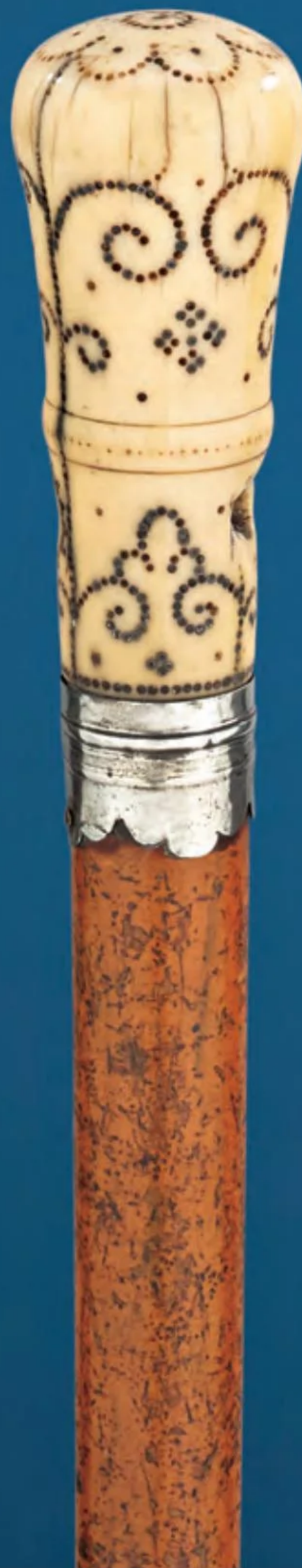
Decorative Piqué Cane This exceptionally rare 18th-century cane is an exquisite example of silver piqué work, where small silver pins are used to create an inlaid design. 34" length. $4,450. #30-8485