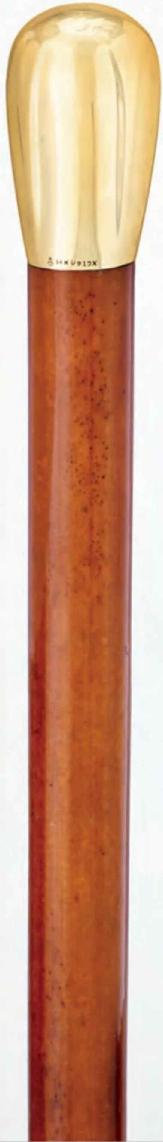
Gold Knob Cane A timeless 14K gold knob engraved with a delicate monogram contrasts the warm wood of the shaft. 34" length. $1,850. #31-2310