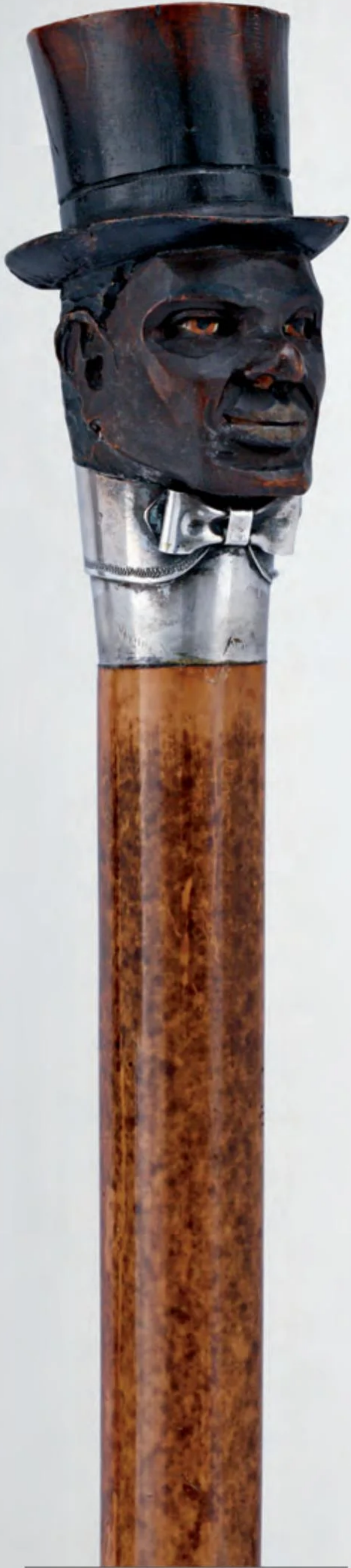
Carved Figural Cane A dapper gentleman in a top hat sits atop this walking stick. His collar and tie are crafted of elegant sterling silver. 38" length. $1,650. #31-2316