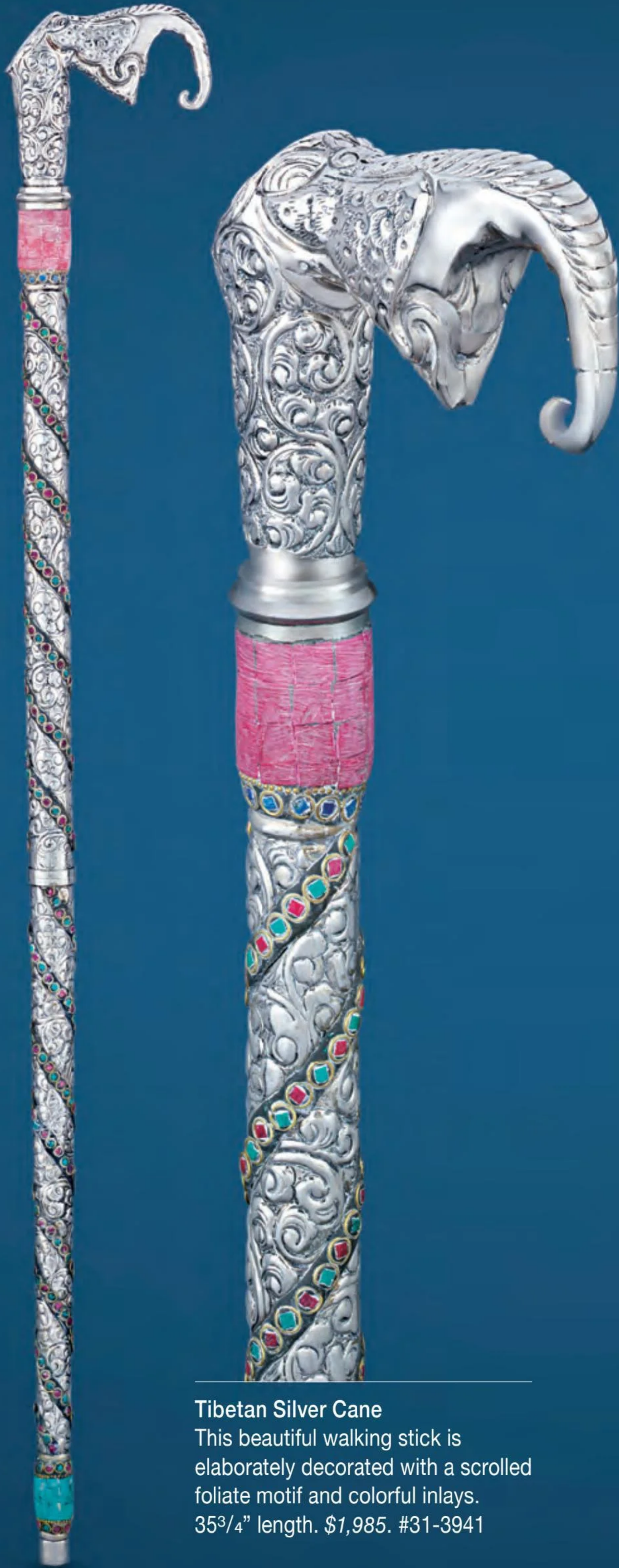
Tibetan Silver Cane This beautiful walking stick is elaborately decorated with a scrolled foliate motif and colorful inlays. 35 3 / 4 " length. $1,985. #31-3941