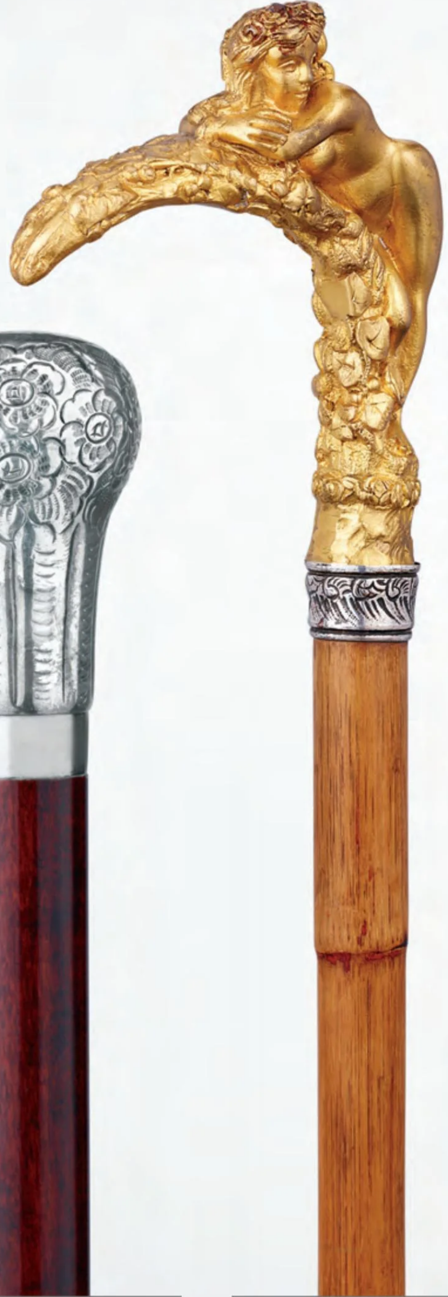
Reclining Nude Cane An alluring female figure is the focal point of this gilt bronze handle, which is covered in lush floral details. 36" length. $4,450. #31-3895