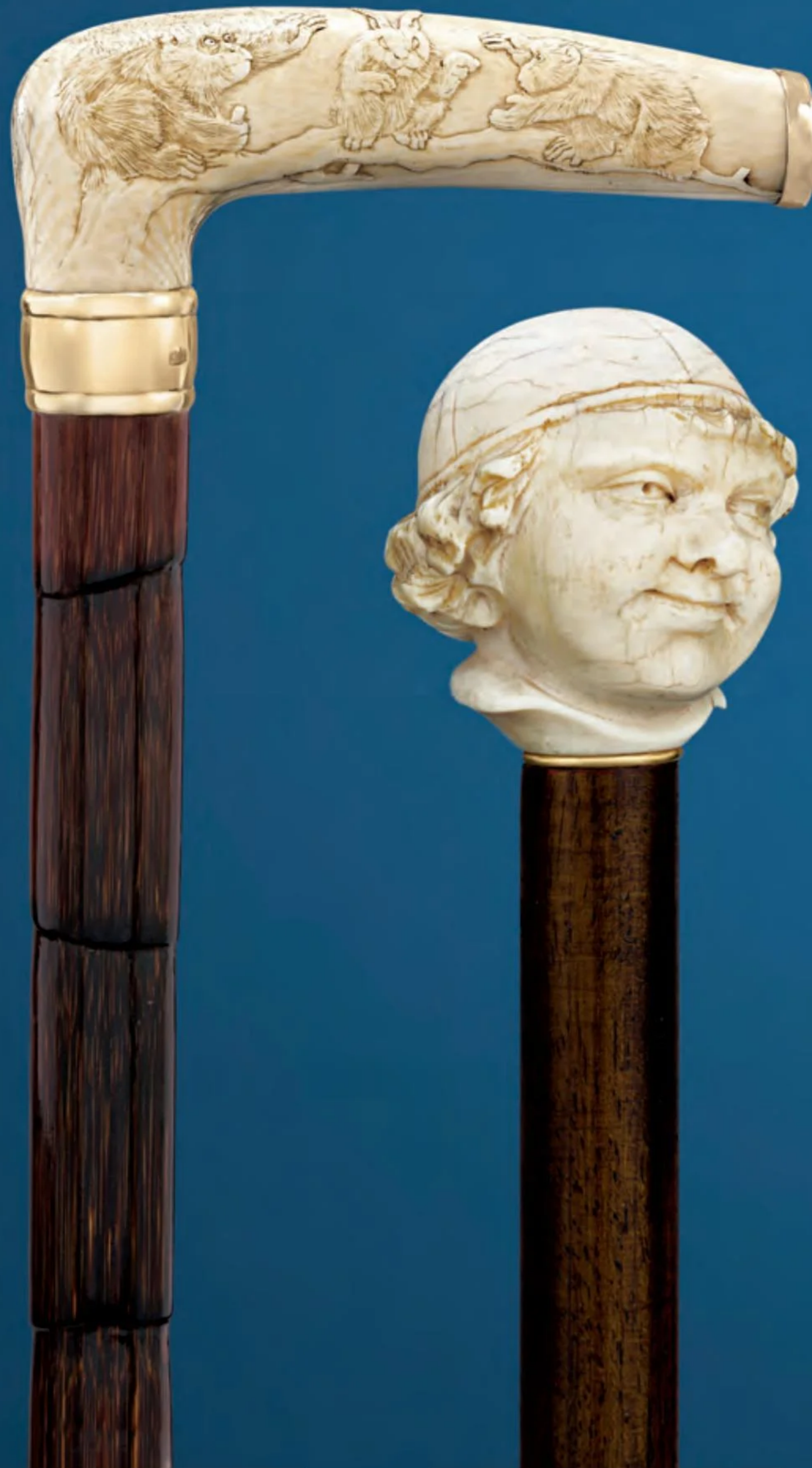
Monkey and Rabbit Cane An intricate scene of two monkeys attempting to capture a rabbit tops the elongated handle of this Japanese cane. 35" length. $1,985. #31-2228