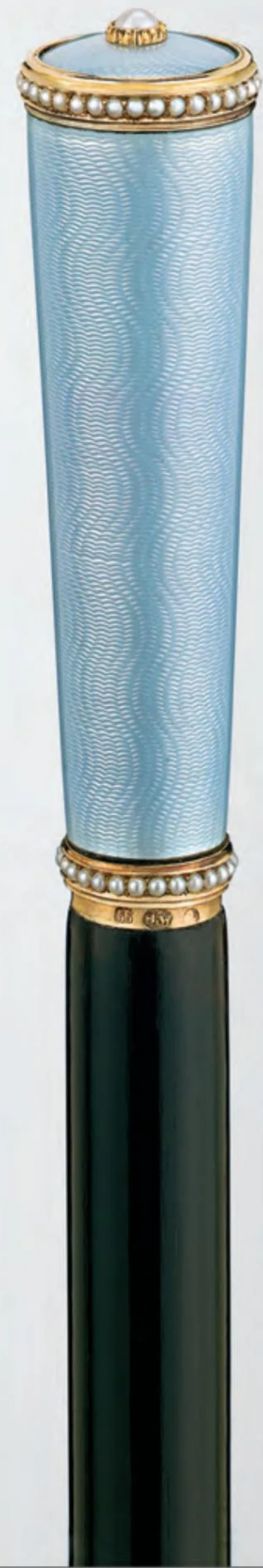
Fabergé Pearl Cane Created by Henrik Wigström, blue guilloché enamel is mounted with bands of engraved gold and pearls. Signed 'H.W.' Marked 56 zolotnik (14K gold). 36" length. $33,950. #30-2232