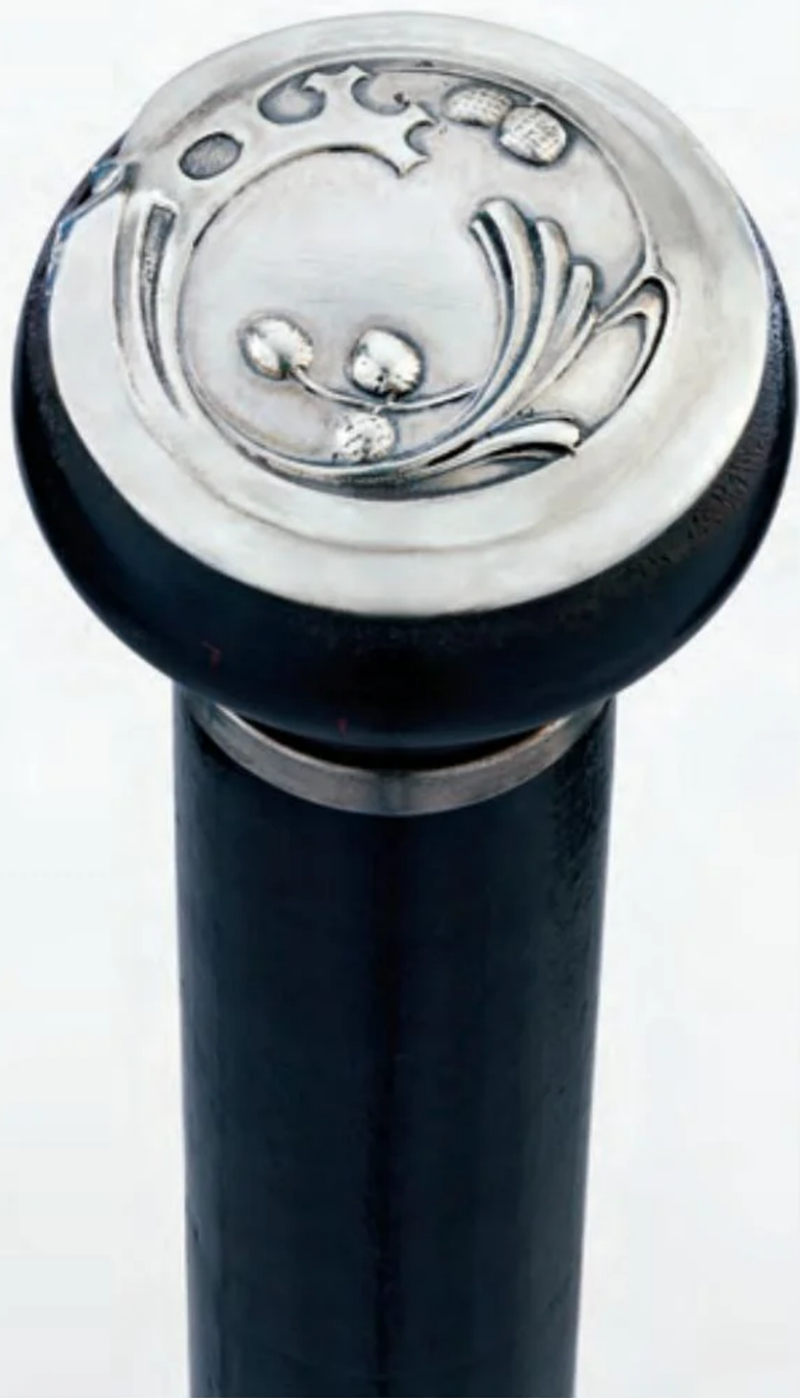
Jeweler's Ring-Measuring Cane This cane houses a ring-sizing device in its hollow handle. The ferrule is used to measure ring sizes. 37 \frac{1}{2} " length. $2,950. #31-1915