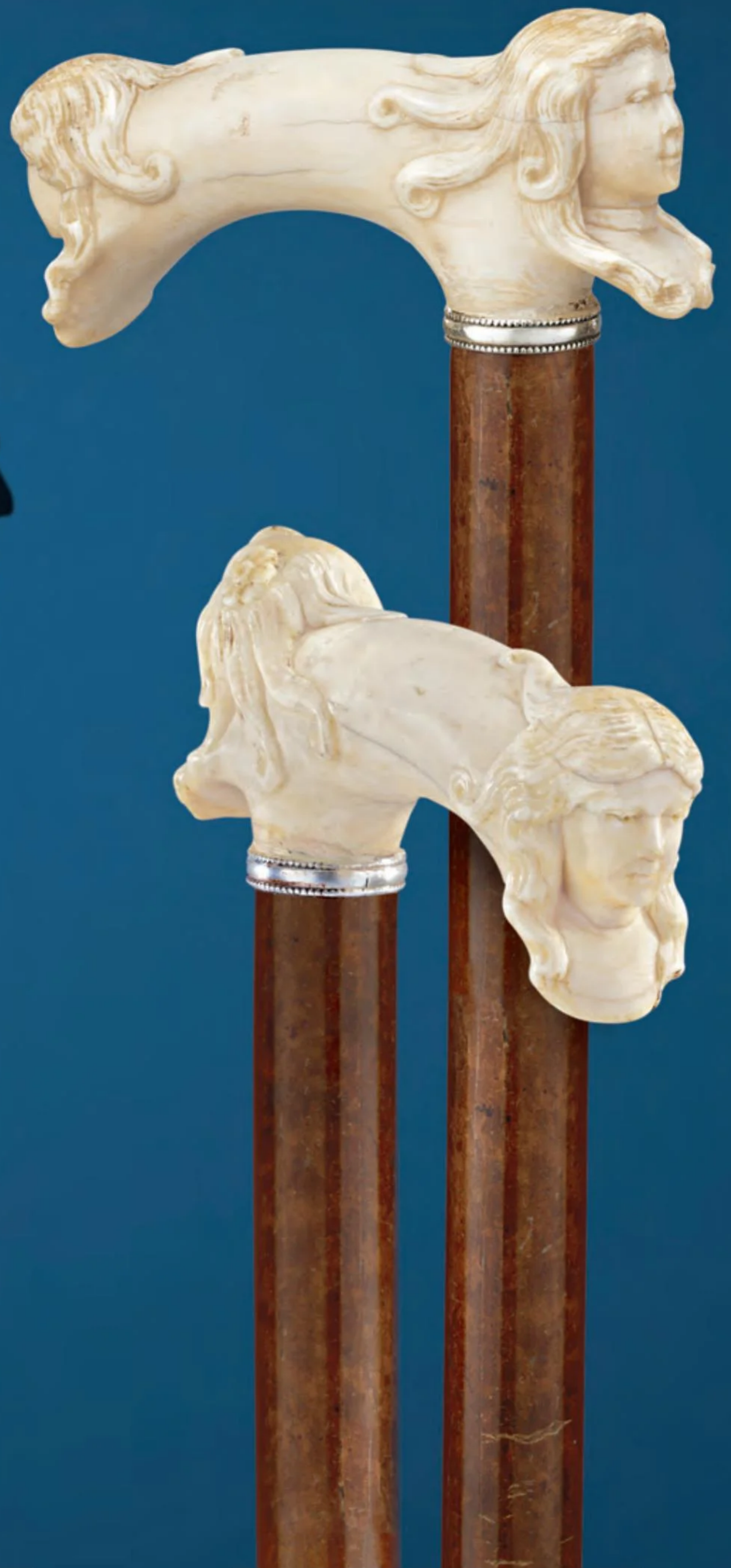
Art Nouveau Cane The busts of two maidens complete with long flowing tresses are carved into the handle of this attractive Art Nouveau cane. 34 1 / 2 " length. $1,450. #31-1975