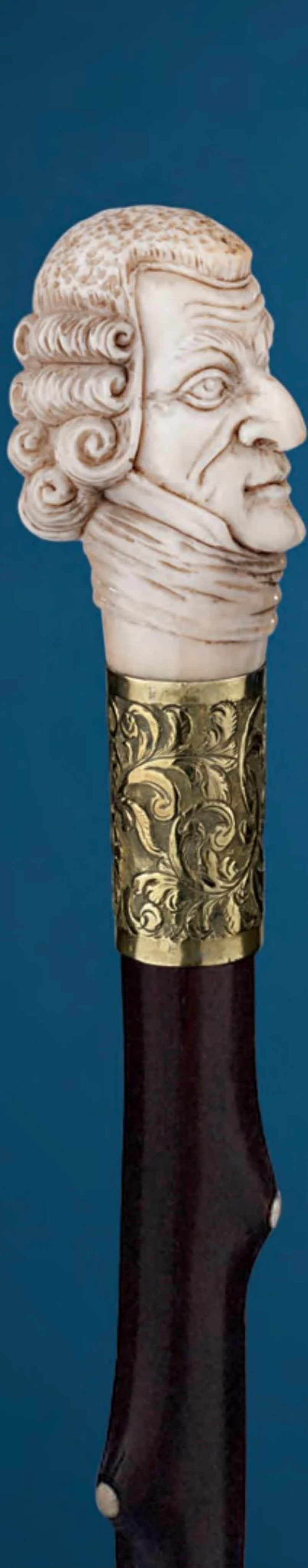
Thomas Jefferson Cane A stately bust of the former president serves as the knob of this decorative walking stick. 35" length. $1,985. #31-2189