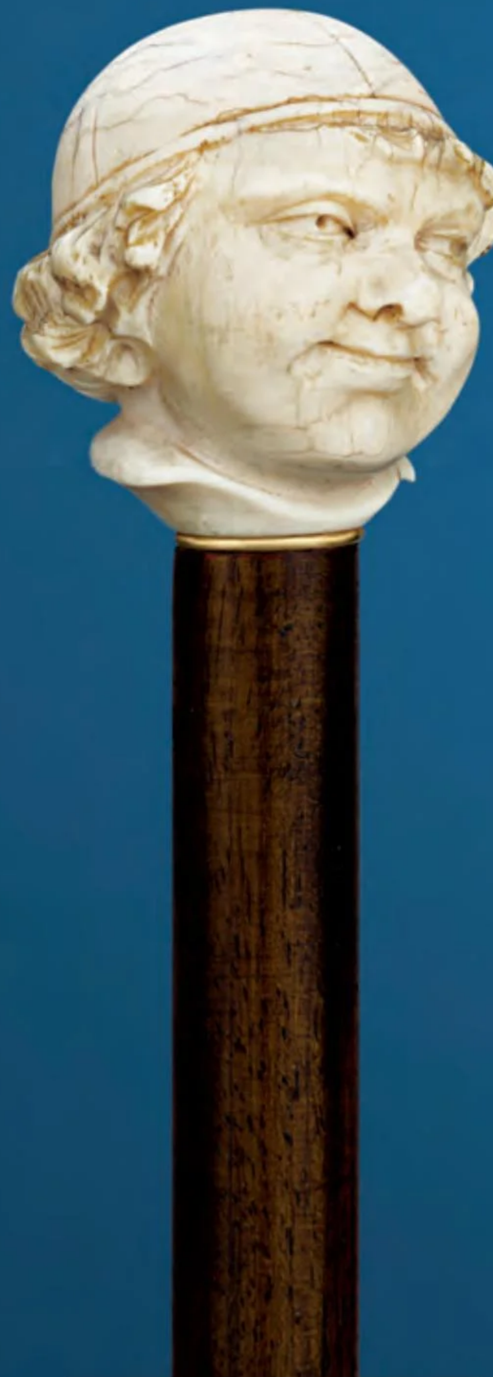
Happy Monk Cane The knob of this elegant walking stick is masterfully carved with the visage of a happy monk. 33 3 / 4 " length. $1,885. #31-1963