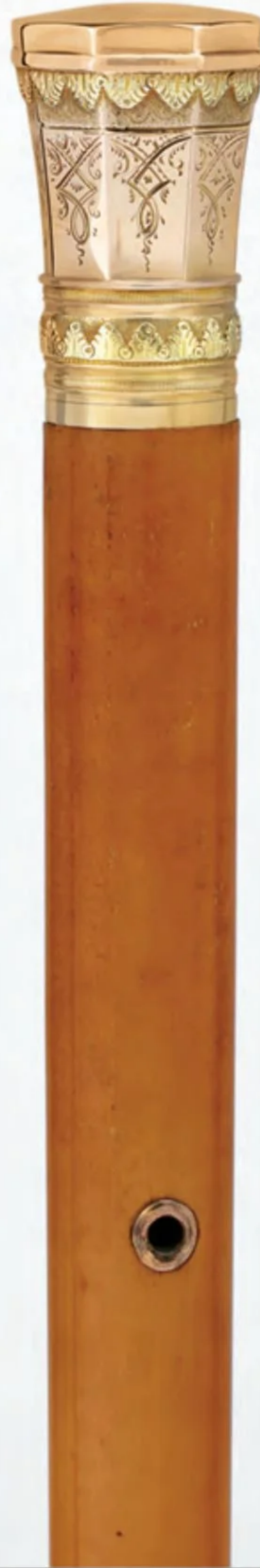
Neoclassical Gold Cane A gold neoclassical knob with intricate chasing and repoussé sits atop a satiny malacca shaft. 34" length. $2,450. #31-2311