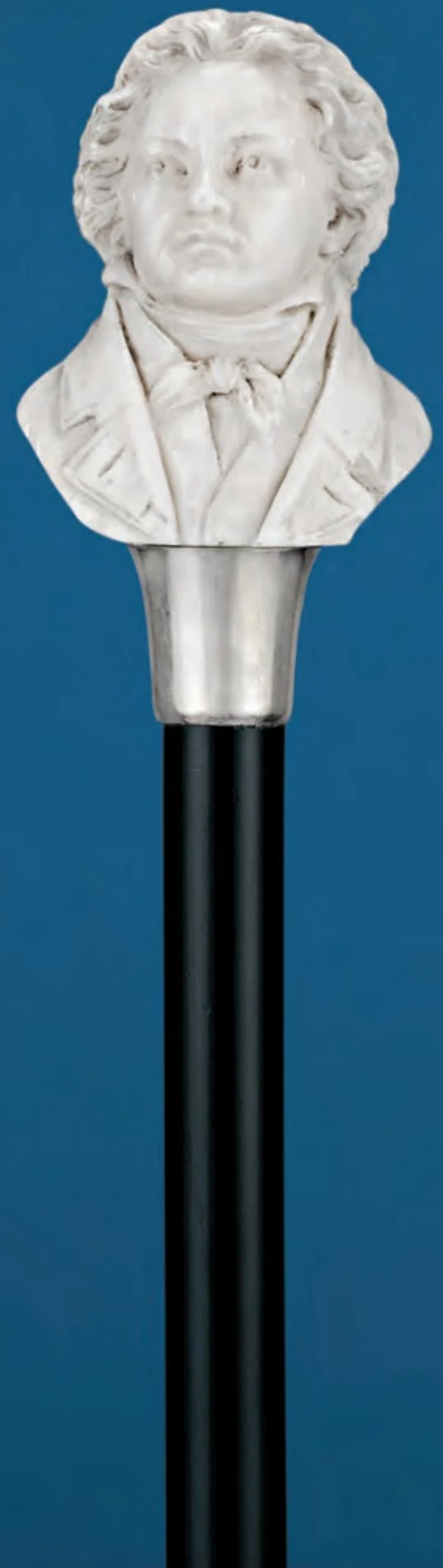
Beethoven Cane Beethoven's amazing likeness adorns this cane, featuring the telltale tousled tresses and period attire seen in many portraits of the consummate artist. 37 1/4" length. $2,450. #30-9048