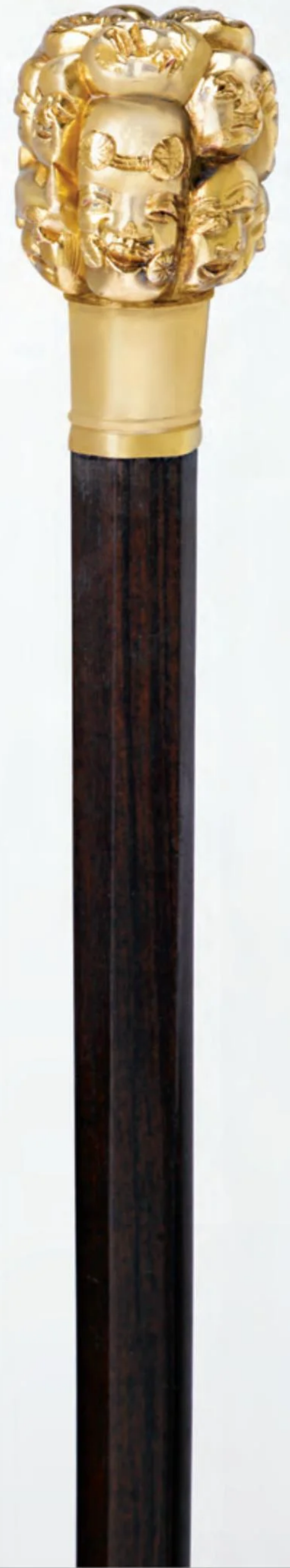
Gold Faces Cane Crafted of 18K gold, this knob is covered in the animated faces of several men wearing a variety of expressions. 33" length. $2,250. #31-2309