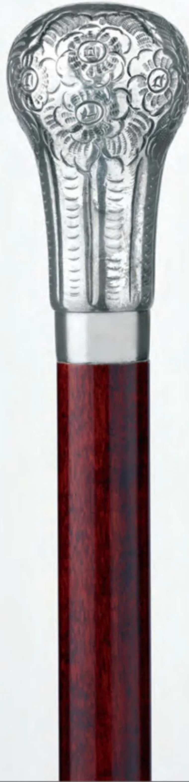
Silver Handle Cane Exceptional artistry defines this elegant walking stick. The cane's gracefully chased silver knob depicts a charming floral motif. 36 1 / 8 " length. $1,285. #31-1903