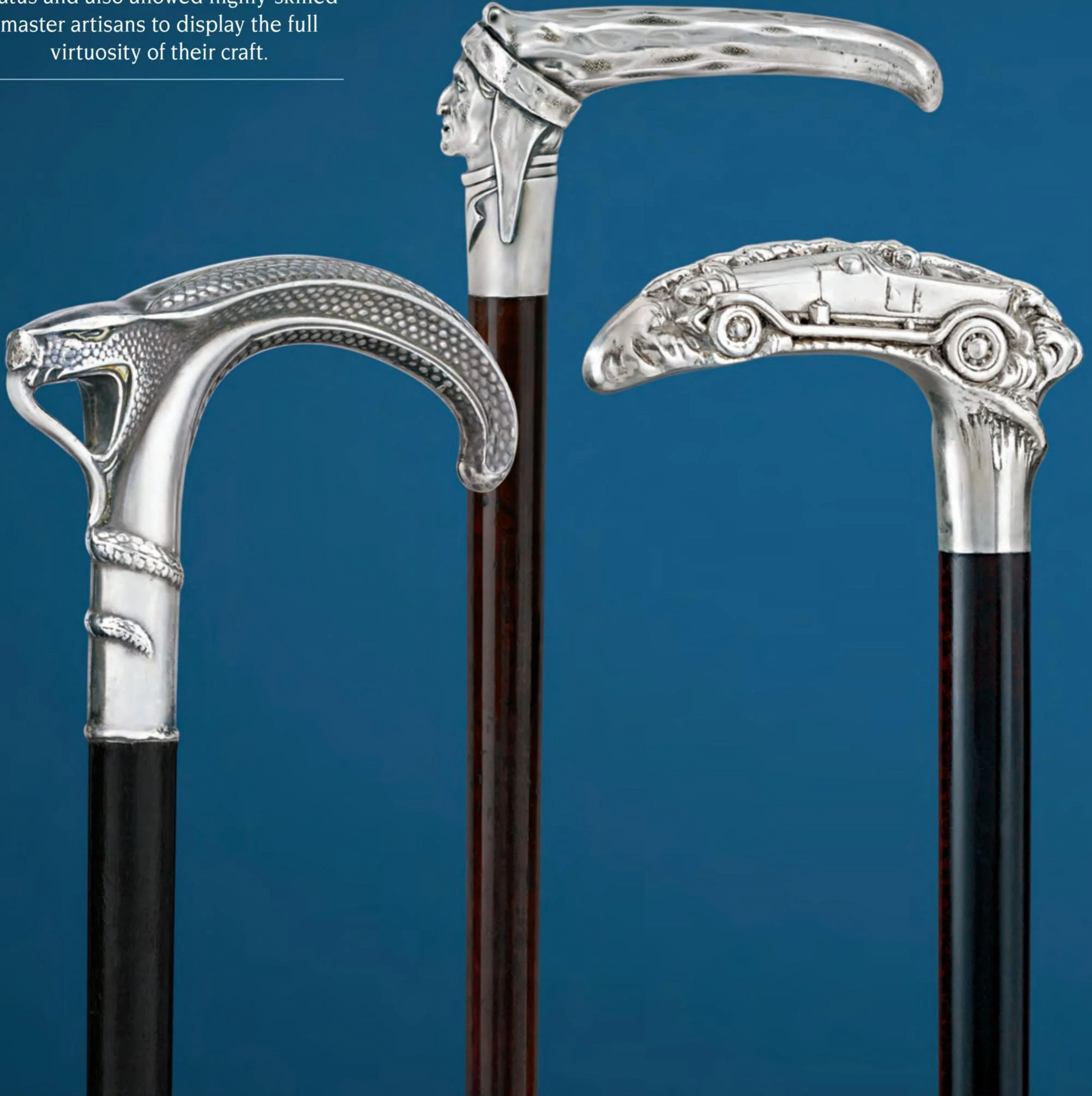
Silver Serpent Cane A snarling, scaly snake is poised to strike on the imposing handle of this cane. 36 \frac{1}{2} " length. $1,885. #31-2013

Decorative canes indicated high social status and also allowed highly-skilled master artisans to display the full virtuosity of their craft.