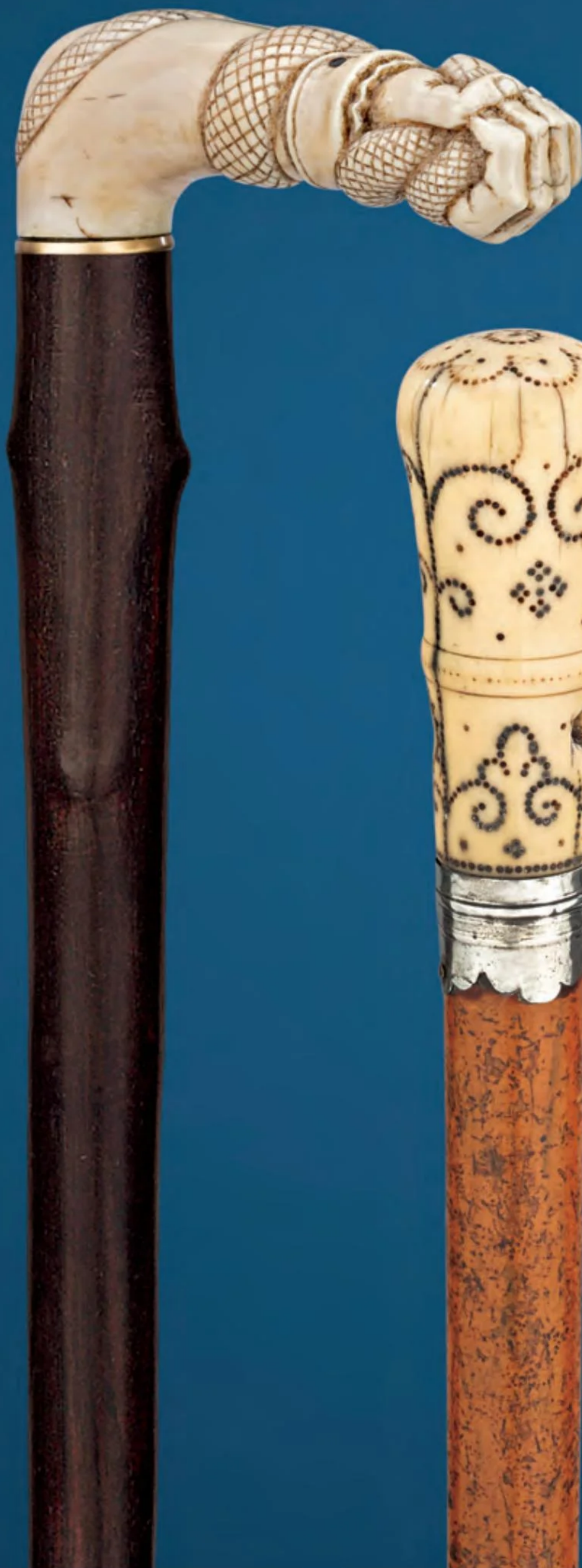
Snake in Hand Cane A fearsome snake slithers around a man's arm in the carved handle of this walking stick, complementing the elegant hardwood shaft. 35 1/2" length. $1,885. #31-1972