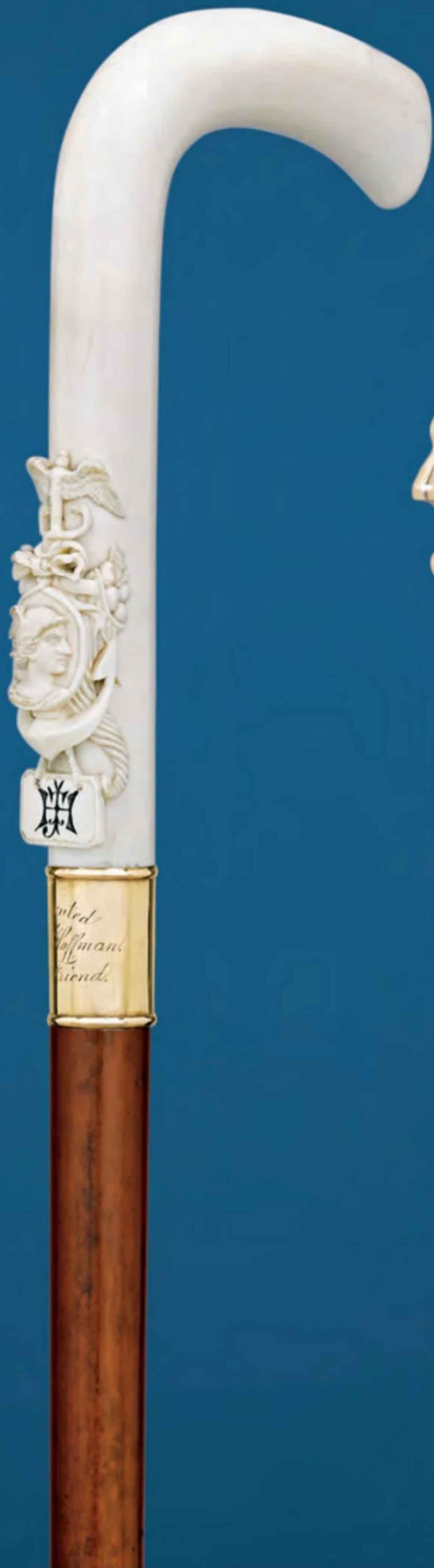
Presentation Cane This beautiful cane features the Roman god Mercury, a stylized monogram and a thoughtful inscription. 35 1 / 2 " length. $1,950. #30-9043