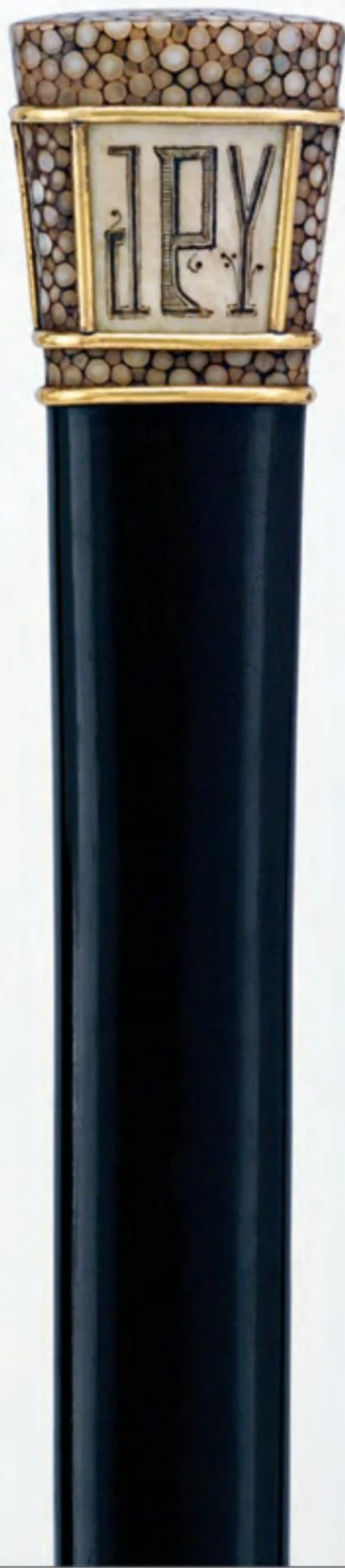
Art Deco Shagreen Cane Shagreen leather is distinguished by its pebbled appearance. Here it frames a fashionable panel displaying the original owner's initials. 36" length. $1,685. #31-2303