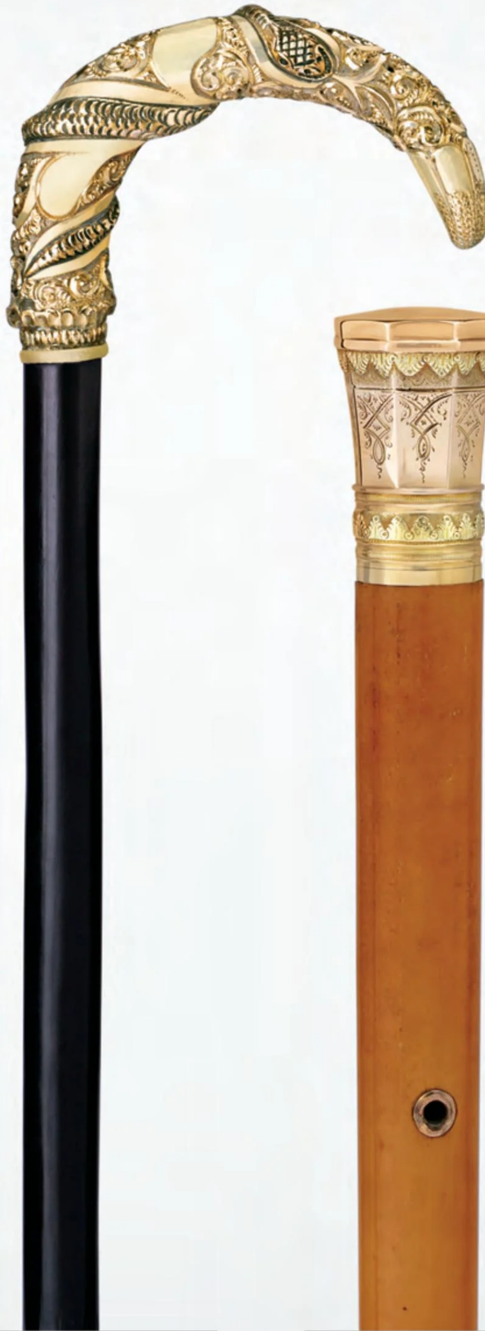
Rolled Gold Snake Cane Marvelously intricate chased and repoussé gold decorates the crook of this cane in a slithering snake pattern. 35" length. $1,885. #31-2304