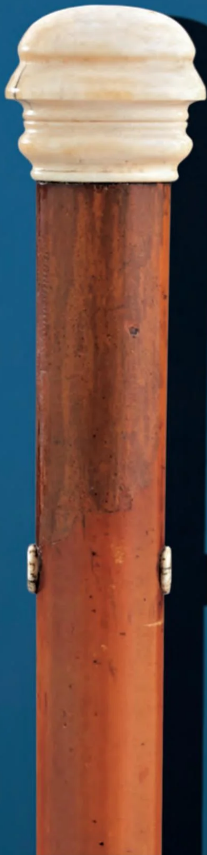
Louis XVI Shadow Cane Used by Royalists to show support of the imprisoned king, this knob casts a shadow of his profile. 37 1 / 2 " length. $3,450. #30-8427