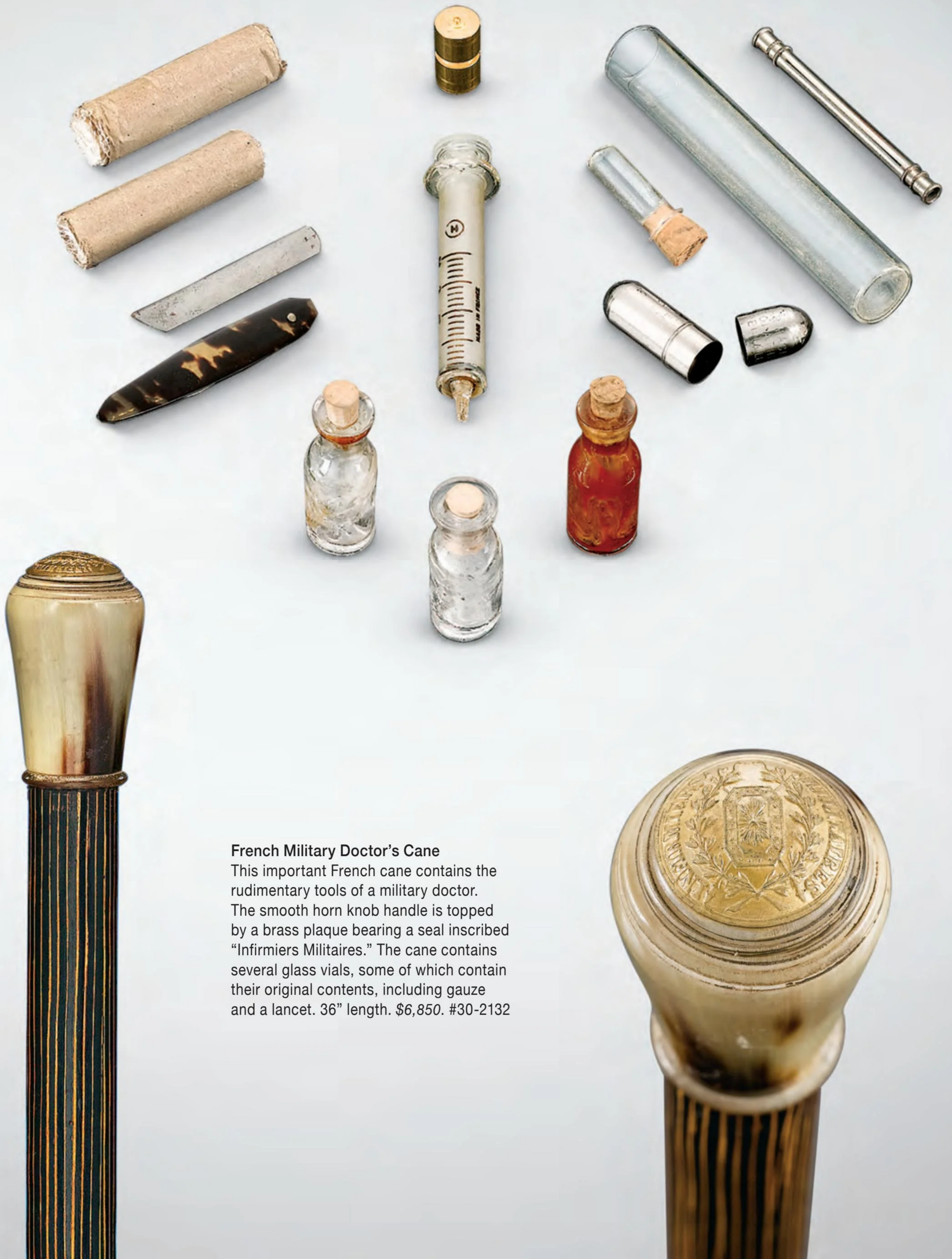
French Military Doctor's Cane This important French cane contains the rudimentary tools of a military doctor. The smooth horn knob handle is topped by a brass plaque bearing a seal inscribed "Infirmiers Militaires." The cane contains several glass vials, some of which contain their original contents, including gauze and a lancet. 36" length. $6,850. #30-2132