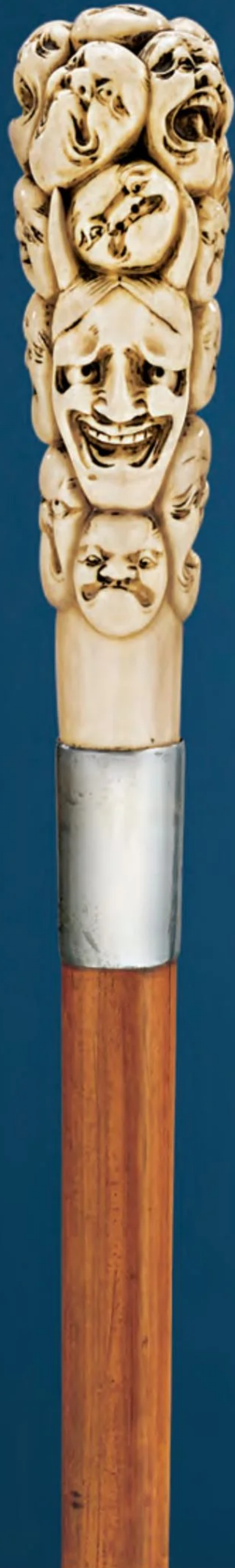
Grotesque Faces Cane Depicting several animated, grotesque faces, the top of this cane is delightfully unique and entertaining. 34 3 / 4 " length. $1,985. #31-1988

More than any other collectible antique, the walking stick is a unique reflection of the person carrying it. There is a perfect cane for every personality and profession.